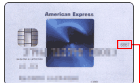
4 Digit Card Verification Number

AMEX – 4 digit number on the front of the card